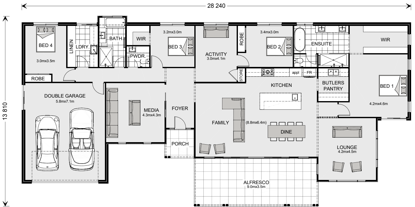
Images depict 318 Hamptons facade. 318 Hamptons floorplan.