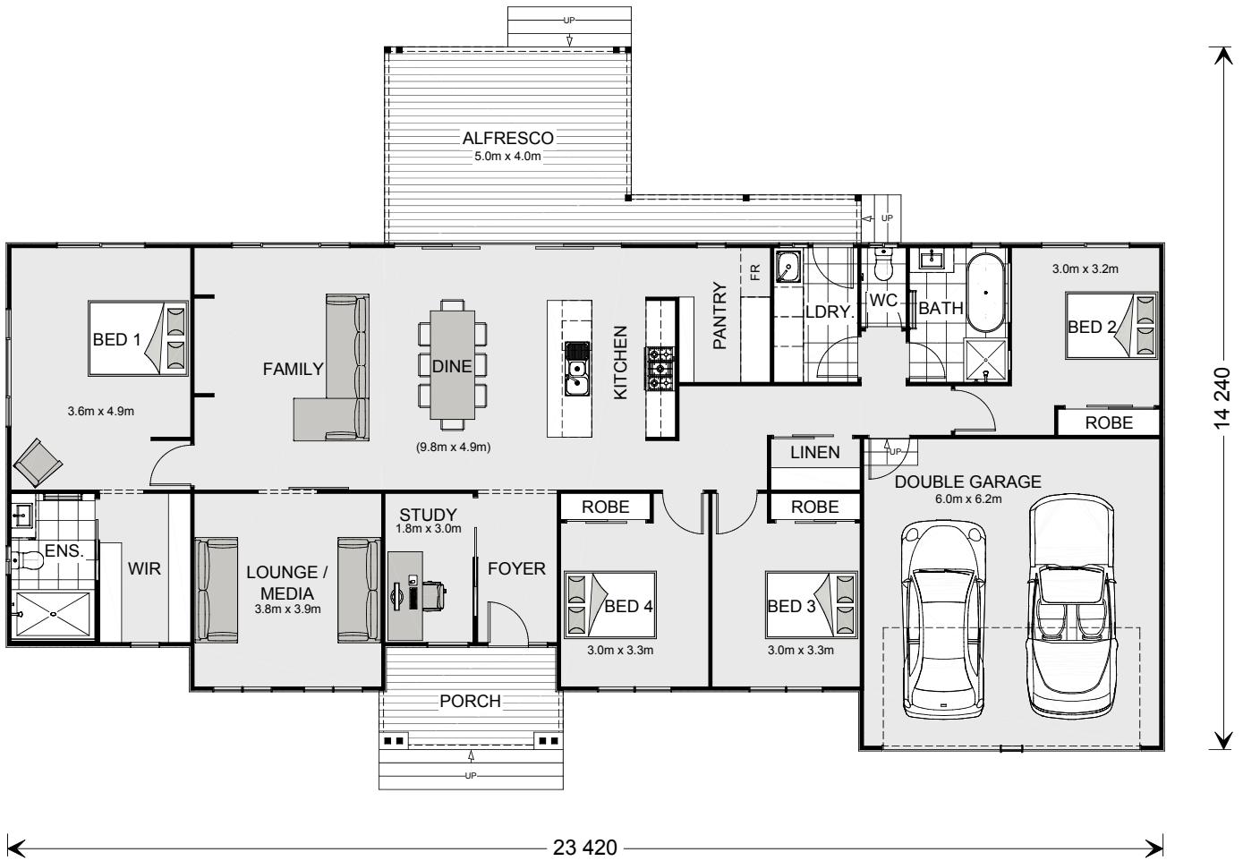
Images depict 245 Hamptons facade. 245 Hamptons floorplan.