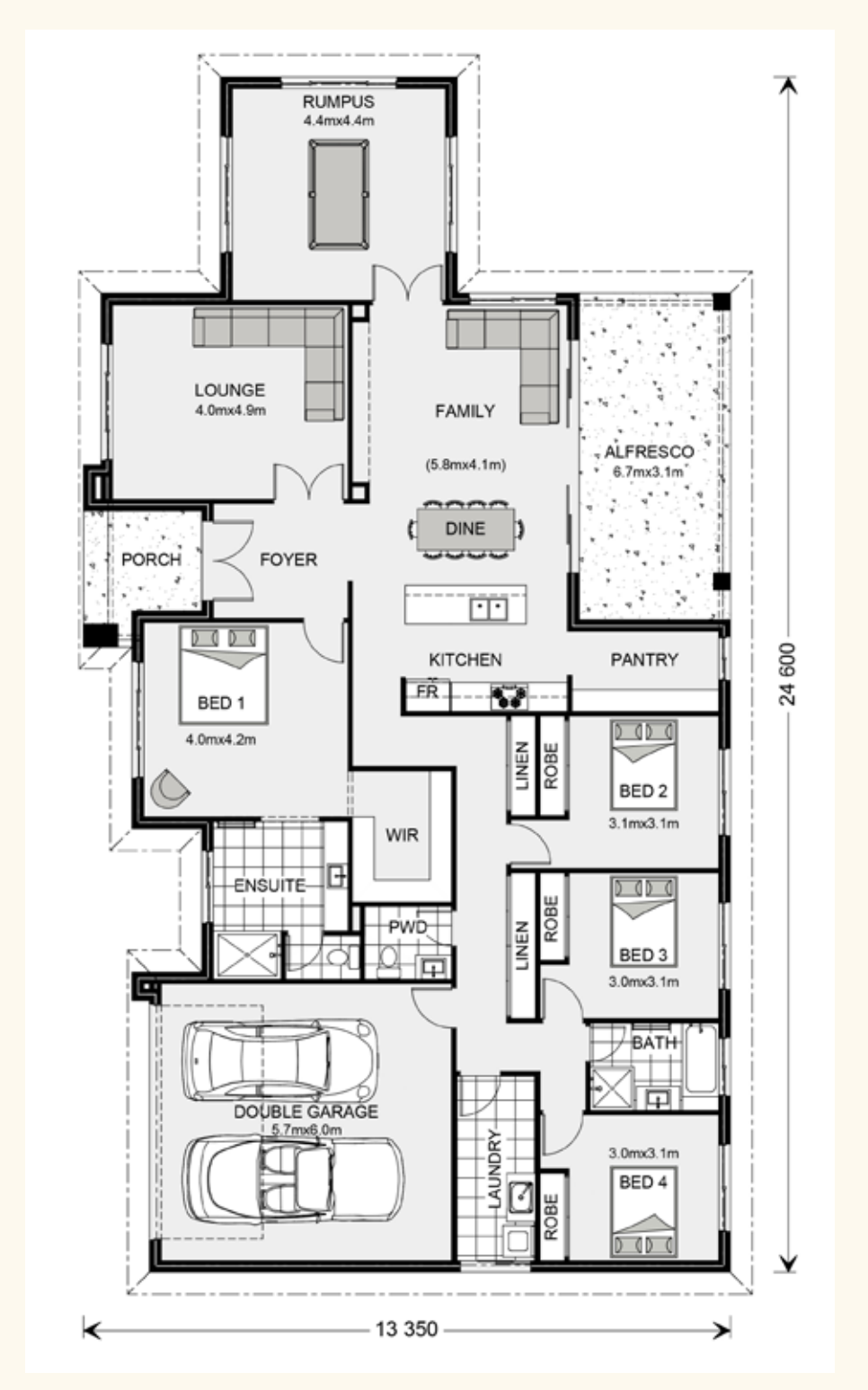
Oakdale 272 Classic facade floorplan