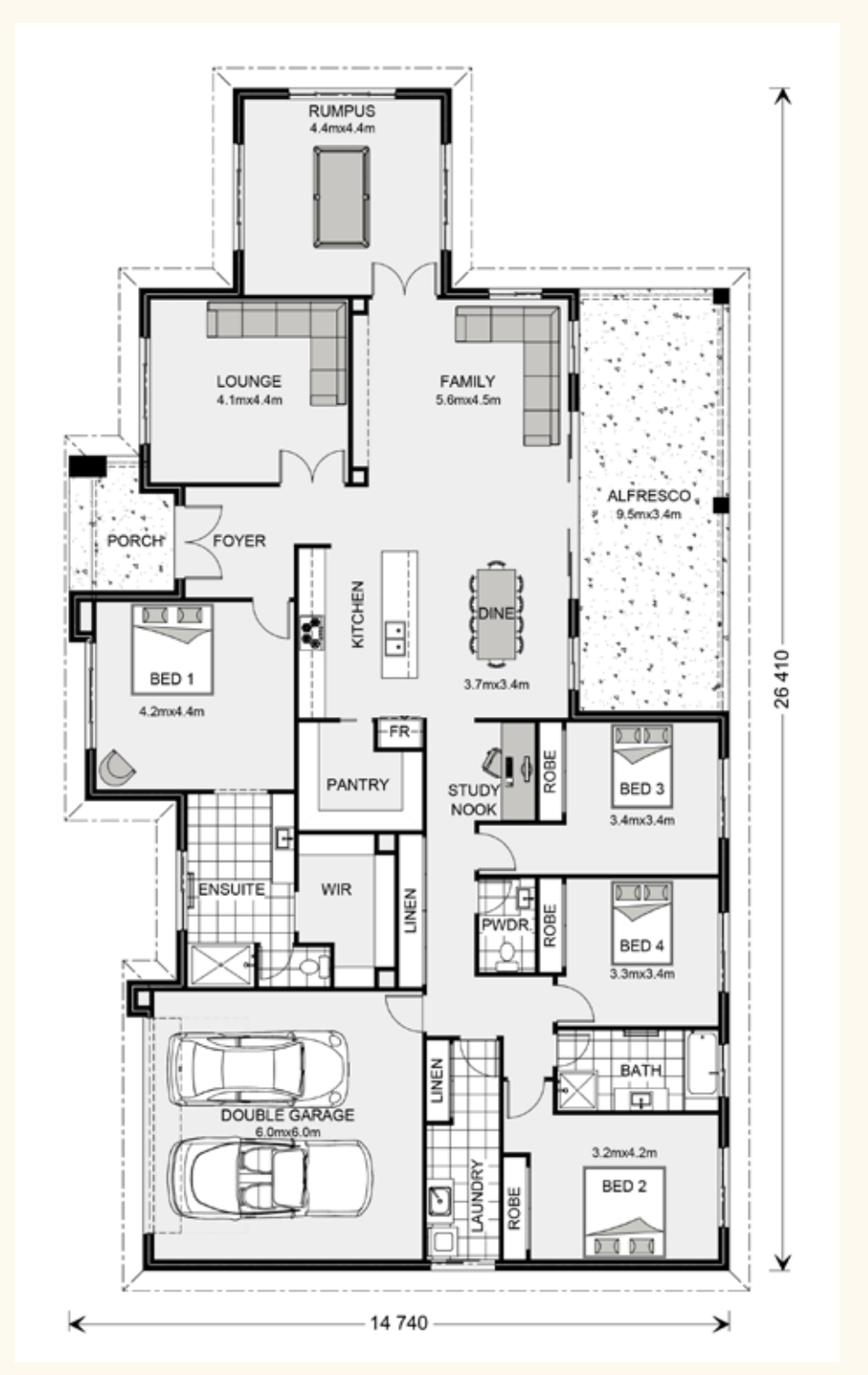
Oakdale 320 Classic facade floorplan