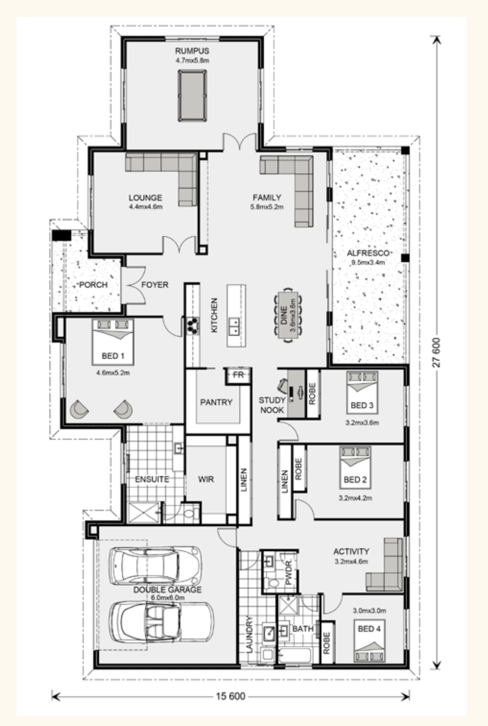
Oakdale 355 Classic facade floorplan