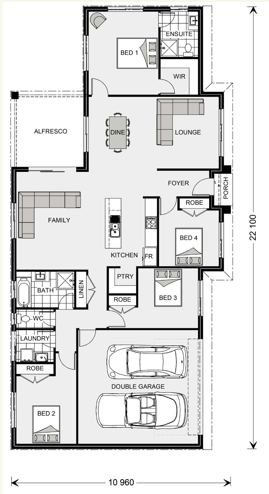
Wishart 206 Classic facade floorplan