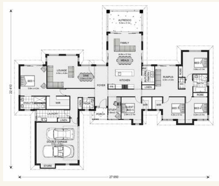
Mansfield 310 Resort facade floorplan