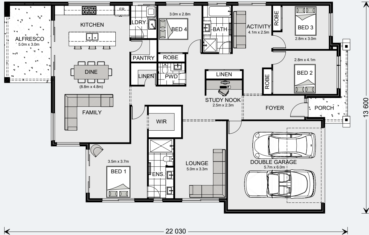
247 Resort Floorplan

Images in this brochure may depict landscaping, fences and upgraded fixtures, features or finishes which are not included. For availability and pricing of these items please discuss with your new home consultant.