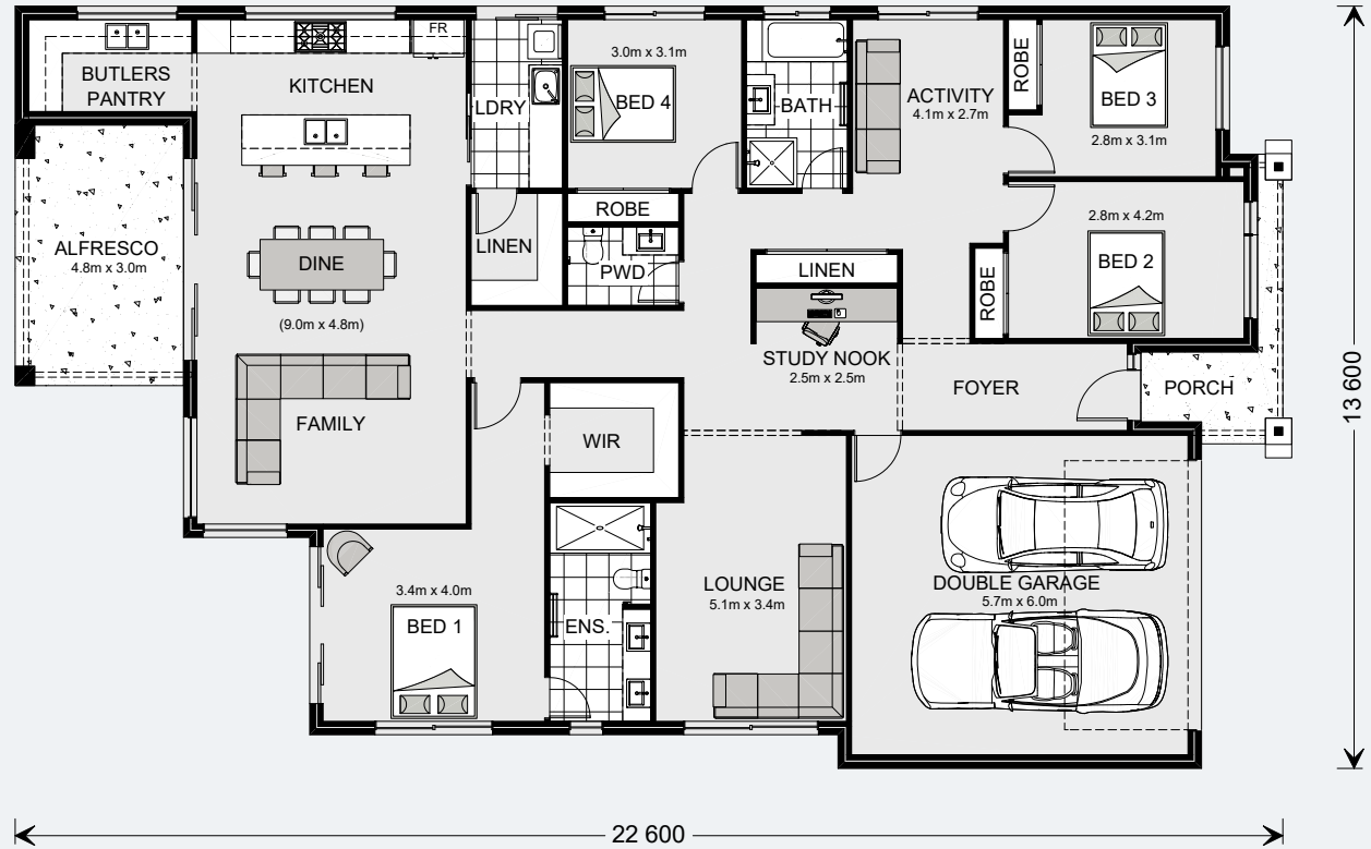
261 Resort Floorplan

Images in this brochure may depict landscaping, fences and upgraded fixtures, features or finishes which are not included. For availability and pricing of these items please discuss with your new home consultant.