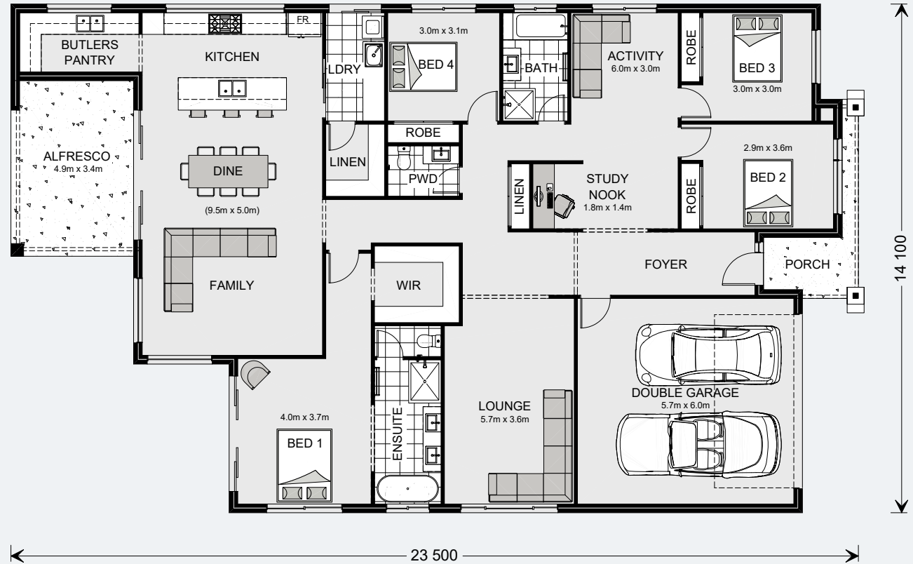
284 Resort Floorplan

Images in this brochure may depict landscaping, fences and upgraded fixtures, features or finishes which are not included. For availability and pricing of these items please discuss with your new home consultant.