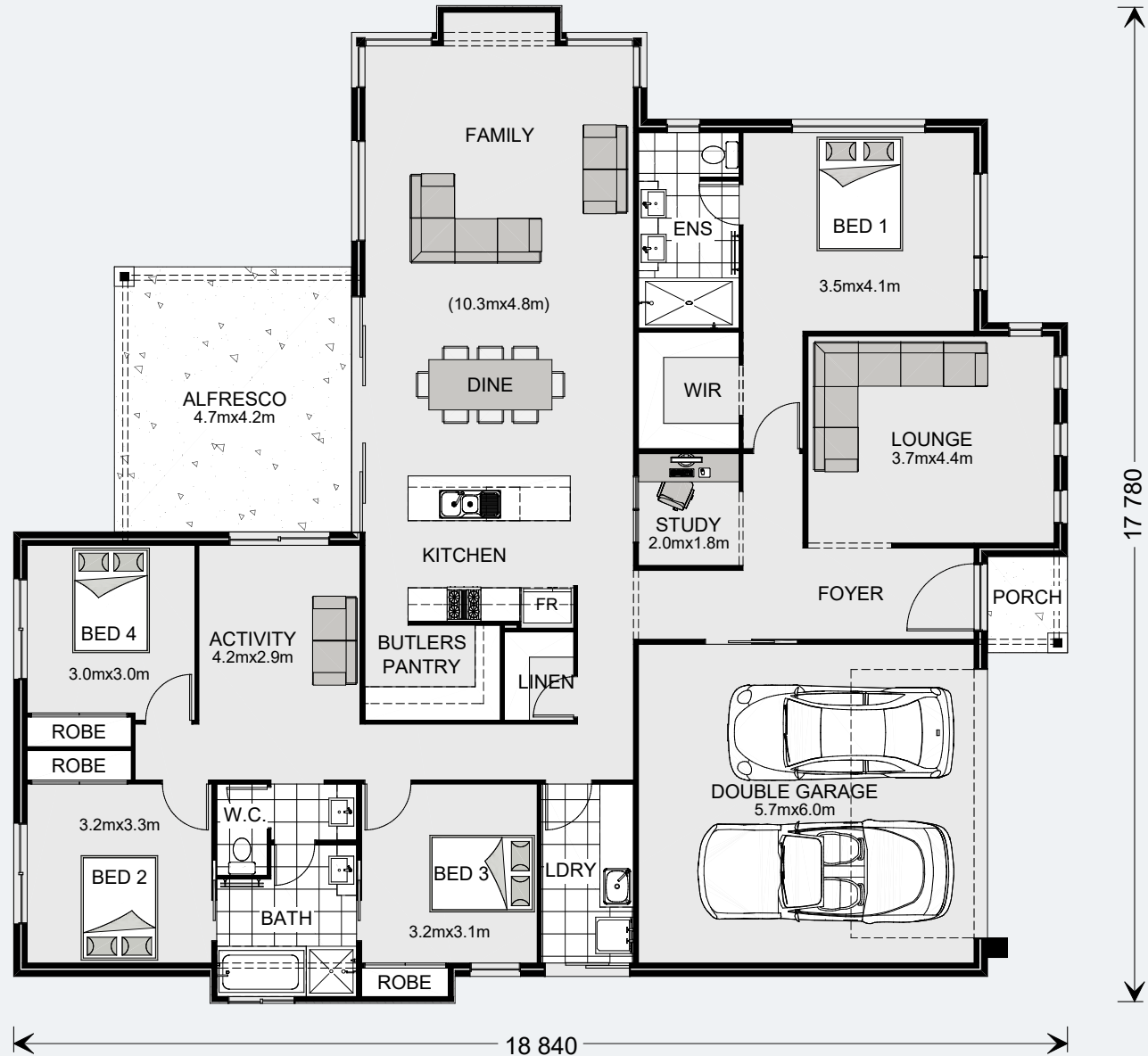
262 Resort Floorplan

Images in this brochure may depict landscaping, fences and upgraded fixtures, features or finishes which are not included. For availability and pricing of these items please discuss with your new home consultant.