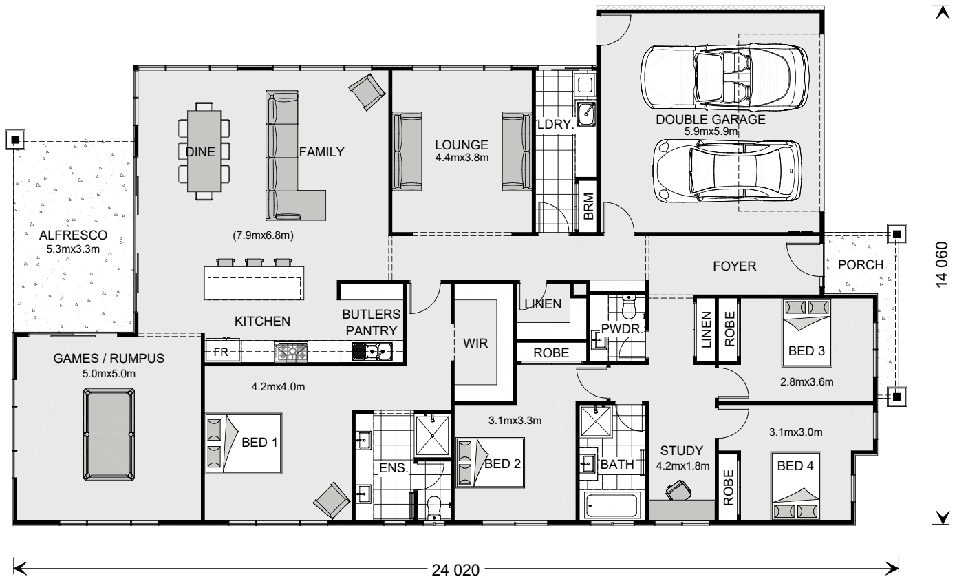
Images depict Broadbeach 289 Hamptons facade. 289 Hamptons floorplan.