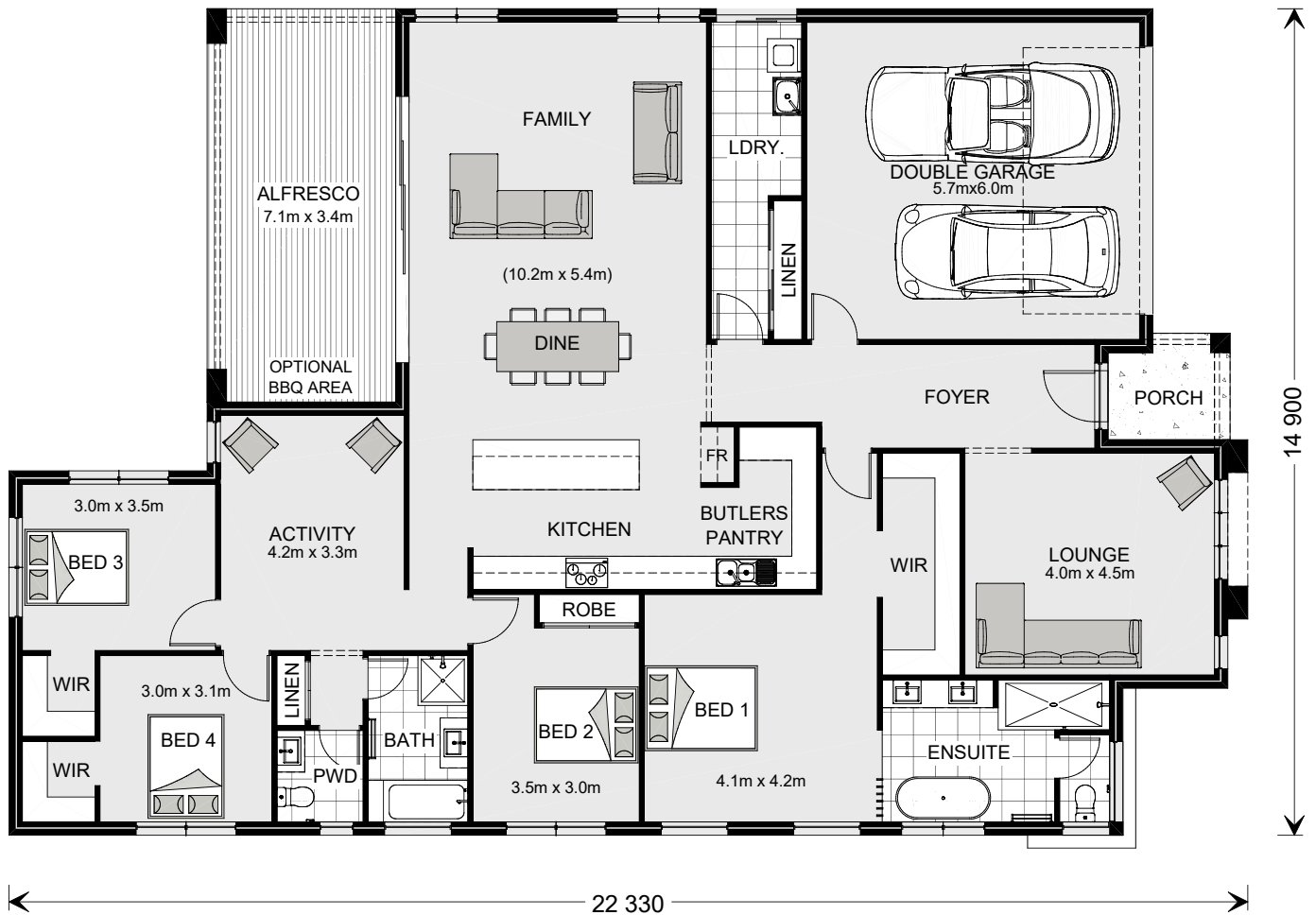
Images depict Launceston display home Vista 285 Beach facade. Launceston display home Vista 285 Beach floorplan.