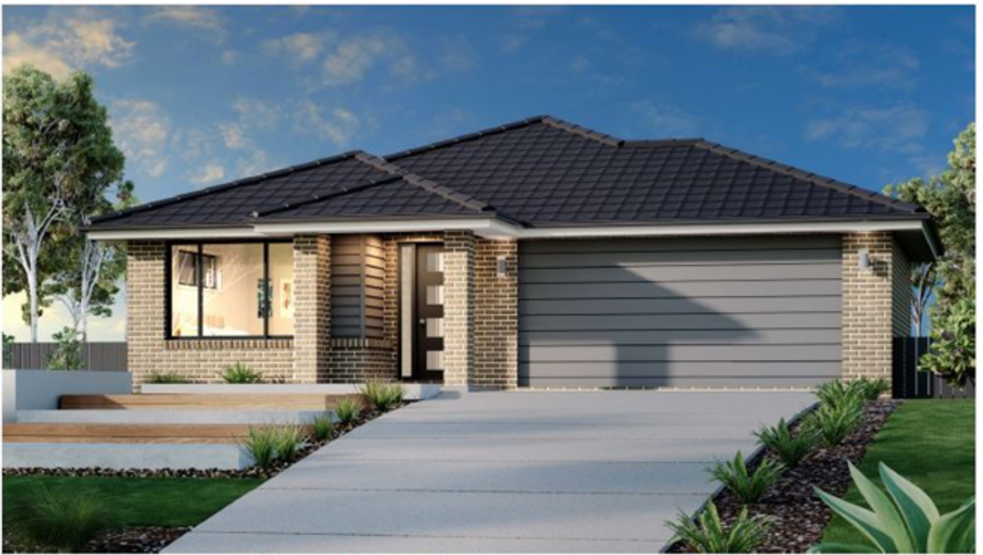
ARTISTS IMPRESSION - for illustrative purposes only (Bridgewater 225 Classic Facade Shown)